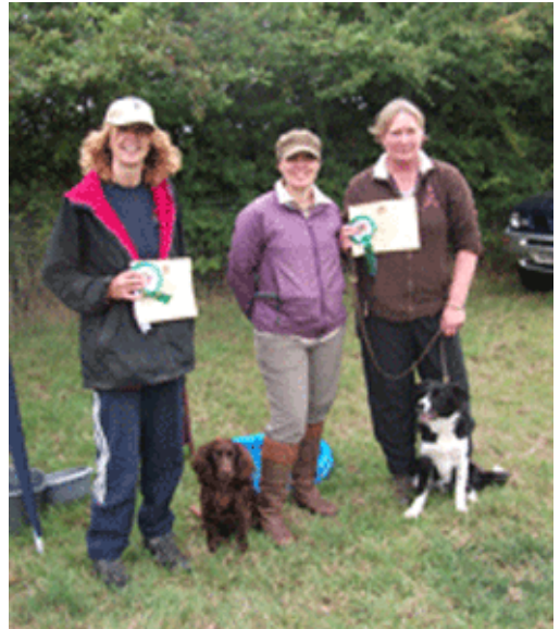
Tests & Qualifications