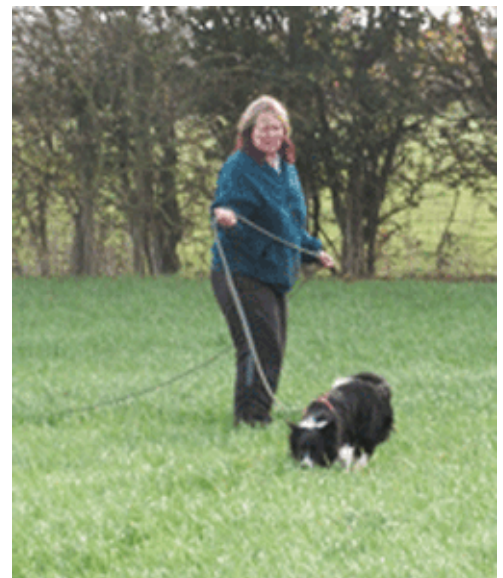
Ideal Bonding Activity

Dogs have a highly sensitive nose, vastly superior to our own. A dog relies on its sense of smell to interpret the world. When you train a dog to track you are training it to work with its strongest sense, its sense of smell. Tracking is something